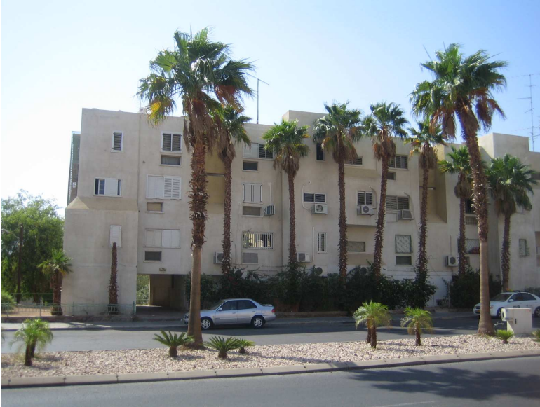
View of Apartment 1146 building on Sheshet HaYamim.