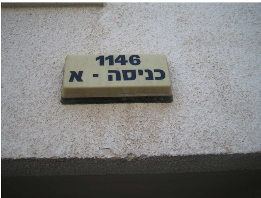
Hebrew entrance sign (entrance "alef") of 1146 Sheshet HaYamim.

The second apartment is 603 on Eilot Street, Apartment No. 7 (see map below).